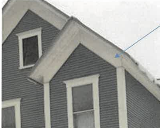
Frieze intersection at corner board example at 68 George Street